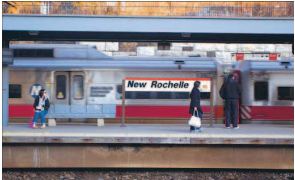
The commute to New York City is a cinch thanks to Metro-North Railroad.

But as with most towns in Westchester County, the city is still identified with families: This winter, Business Week named New Rochelle, with its median income of $89,684, among the top 40 "Best Places to