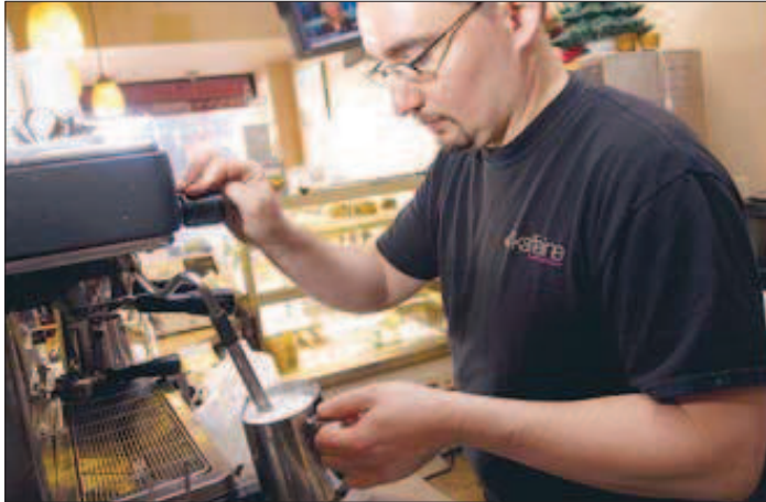
Kaffeine Espresso Bar, located at 18 Division St., New Rochelle.

Critics call this entertainment complex a magnet for crowds, noise and high prices. That said, expect an IMAX theater, go-karts, a skating rink, laser tag and an 18-hole glow-in-the-dark mini golf course in one place.