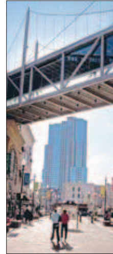
Take a stroll around the city of New Rochelle.